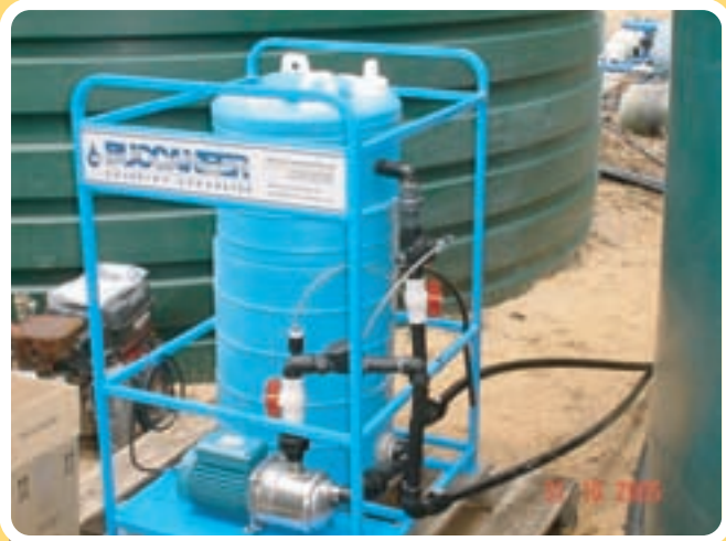
THE BUCCANEER UNIT IS IDEAL FOR USE IN A VARIETY OF POULTRY APPLICATIONS